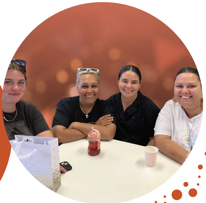
Image: Left to Right: